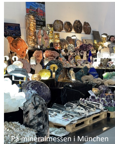
På mineralmessen i München