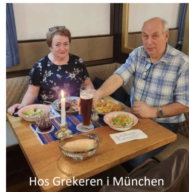
Hos Grekeren i München